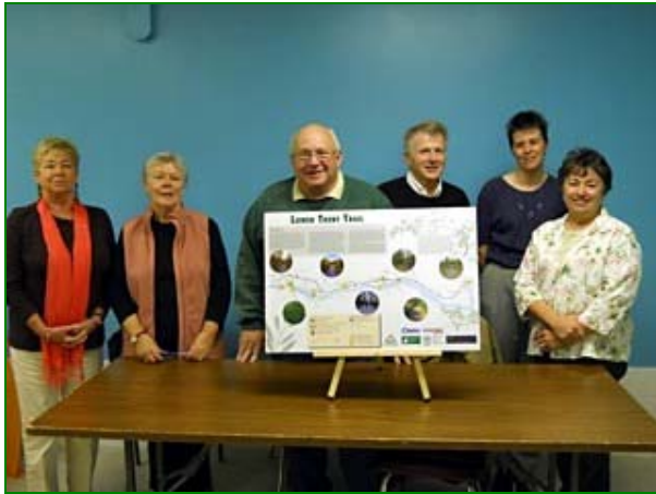
2010 Executive Committee

The Friends of the Trail Inc. was established in 2004 by a group of Quinte West citizens determined to make good use of the former rail bed.